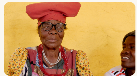
Stories, dreams and everyday contexts of young Namibians